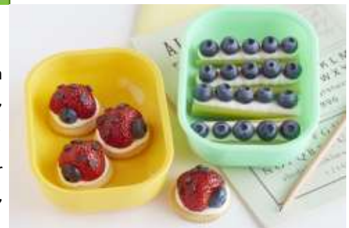
(Article from choosemyplate.gov)

Put kids in charge. Ask your child to name new veggie or fruit creations. Let them arrange raw veggies or fruits into a fun shape or design.