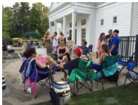
Photo from Friday Cheers July 15

*Anyone looking to join our social team please join our Facebook group: "Grove Social Club" or socials@thegrovehoa.com . We're always looking for volunteers for the committee, and to help out with events.