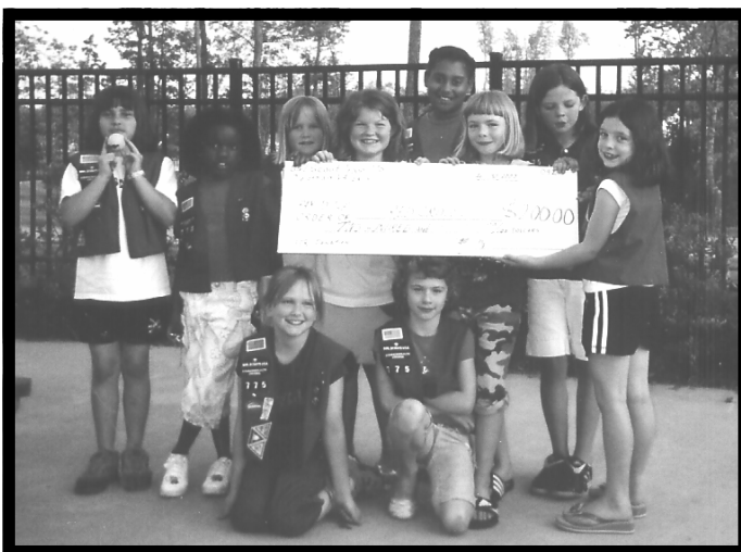
Girl Scout Troop 775 of the Grove donated $200 to the Greater Richmond American Red Cross from their cookie sales money.

Immediately contact the treasurer if you have not paid before 2007 liens are placed. (contact info on page 2)