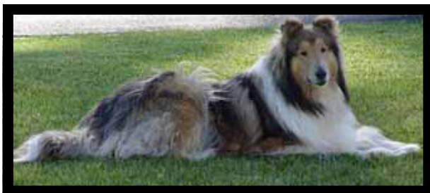
11 year old collie "Scout" - An icon of Gravity Hill