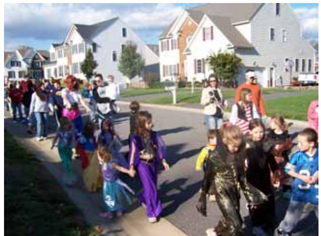
Coalbrook's Halloween Parade