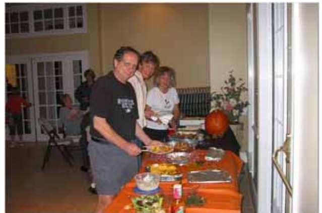
The Grove's October Potluck Supper