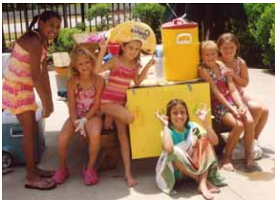
Brownie Troop #775 selling lemonade for the 6th Annual Anthem LemonAid "kids helping kids with cancer"

When the county's Emergency Operations Center is activated to deal with a crisis situation, the county will have the capability to make live or recorded announcements about road conditions, shelters, the availability of drinking water, expert advice on a wide range of public-safety and health matters, and much more.