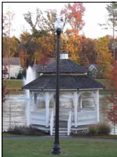
NEW LIGHTING AT THE GAZEBO FOR SAFETY!