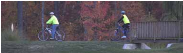
A bike ride around the pond on a brisk fall Sunday afternoon!