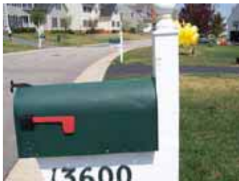
Yellow ribbons covered the Grove