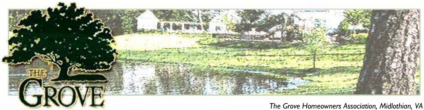
The Grove Homeowners Association, Midlothian, VA