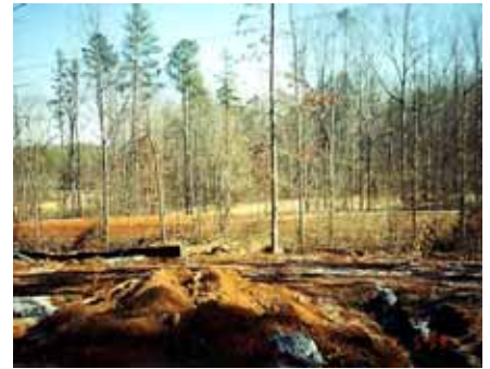
Looking at the Reams lot toward Gravity Hill