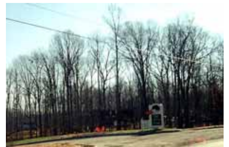
Front entrance of The Grove at Coalfield.

The Grove has become a great subdivision, and we are very glad we decided to live here.