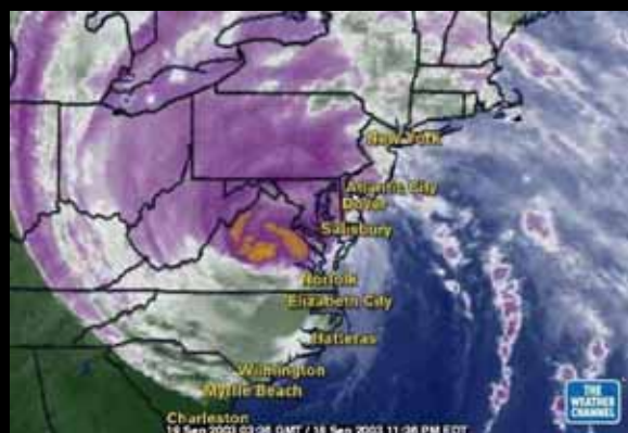
Isabel from the International Space Station