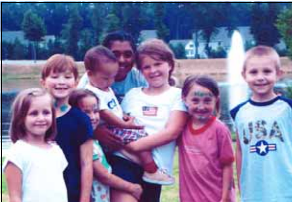
Biggin Ponders celebrate July 4th

THE GHOA, THE GROVE MINER, & EDITOR ARE NOT RESPONSIBLE FOR ANY TYPOS OR OMISSIONS, NOR DO WE NECESSARILY ENDORSE THE PRODUCTS, PEOPLE, ISSUES, AND/OR SERVICES OFFERED IN THE NEWSLETTER OR WEBSITE THROUGH ARTICLES, PAID ADS, OR FREE CLASSIFIEDS.