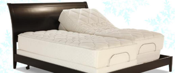
Split Bed Available