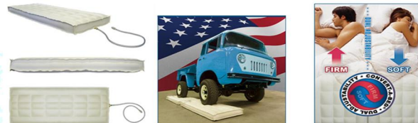
Quality Air Support