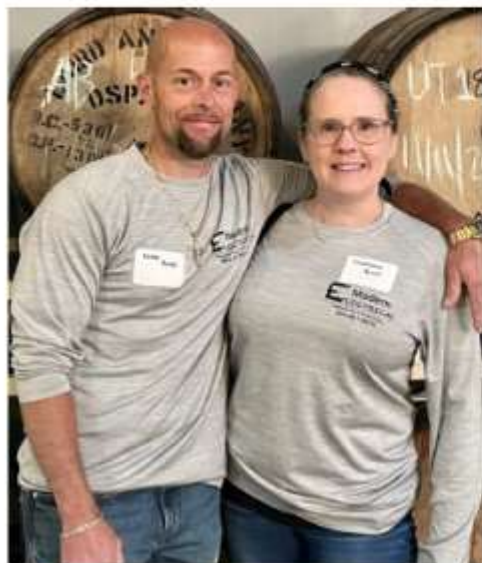
Mercy Mall United Fundraiser 2023

Class A Contractor * Licensed and Insured * A+ BBB Rating * Family Owned and Operated