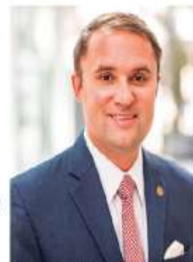
Speaker: Virginia Attorney General, Jason Miyares

Chesterfield Triad strives to educate seniors and caregivers about programs, services, techniques and systems that help prevent crime against seniors and improve their quality of life.